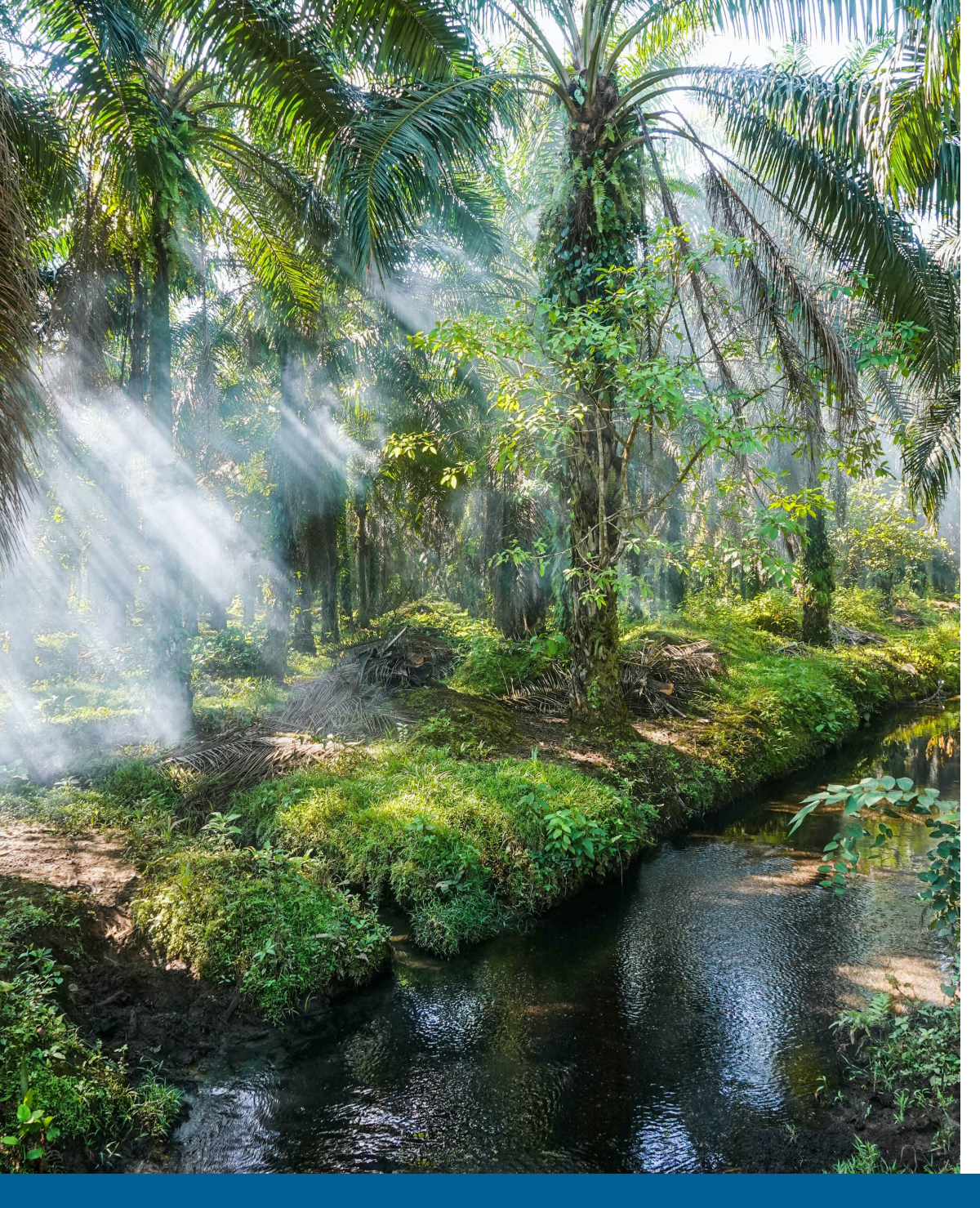
CULTURAL & COMMUNITY EXPLORATIONS