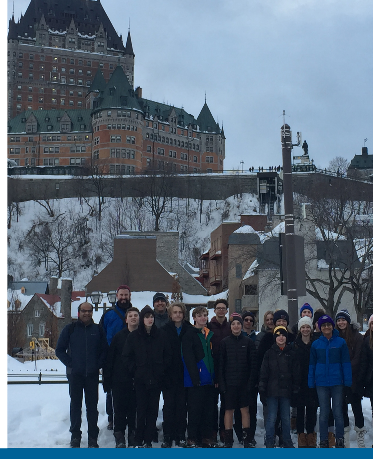
CULTURAL & COMMUNITY EXPLORATIONS